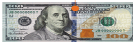
3-D Security Ribbon

The $100 bill has been redesigned many times since 1928 with the most recent that went into circulation on October 8, 2013. Over a decade of research and development went into its new security features such as a 3-D security ribbon and a bell in the inkwell.